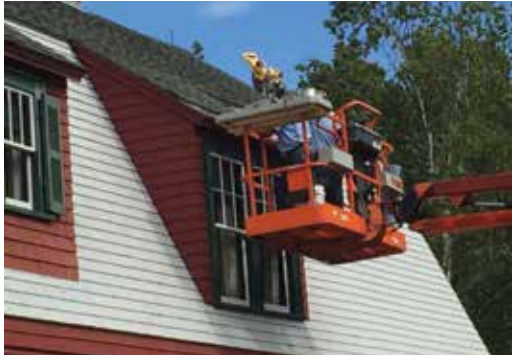
Preserving and maintaining historic properties is an ongoing process; 2016 was no exception.

Tea with Eleanor ticket/group sales at Wells-Shober Cottage increased 42%.